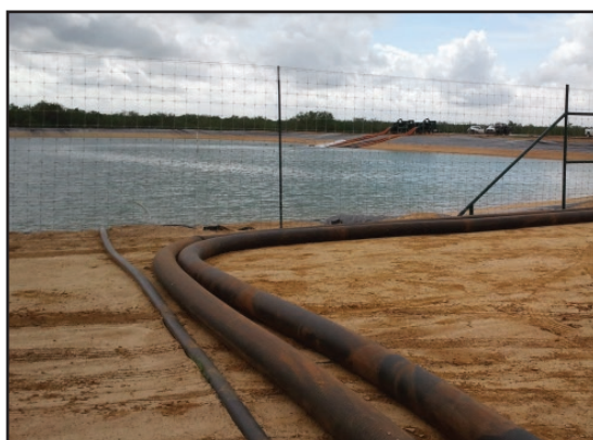
Ideal for water transfer.