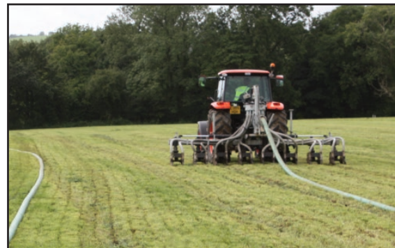
Ideal for drag manure spreading.