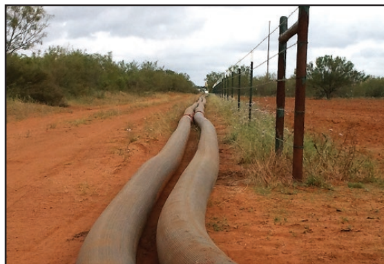
Ideal for water transfer.