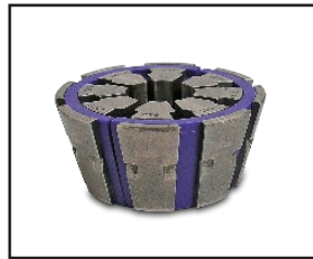
T400 12mm Die Set P/N:PF402-12D