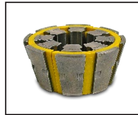
T400 14.2mm Die Set P/N:PF402-14.2D