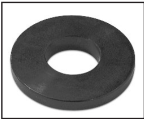
T400 Main Pusher Plate W/ Magnets P/N:PF400-MPP

The PF402 Tooling is compatible with most of the weatherhead® crimpers.