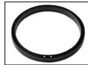
T400 Spacer Ring #2 P/N:PF402-2-SR