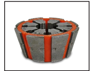
T400 17.4mm Die Set P/N:PF402-17.4D