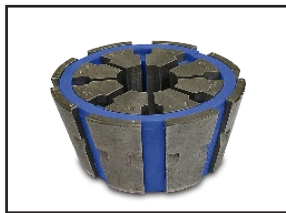
T400 22.2mm Die Set P/N:PF402-22.2D