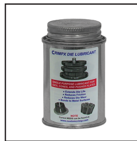
CRIMPX Die Lubricant (Available) Grease 4 oz can with brush P/N:104162