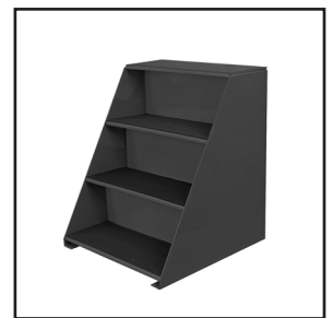
Die Storage Shelf (Available) P/N:101431