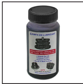
CRIMPX Die Lubricant: Oil 4 oz bottle with dauber cap (Included) P/N:103886