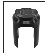
Removable Pusher P/N:100825