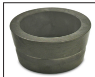
Adapter Bowl 420 to 400 Bowl P/N:PF420/400-AB