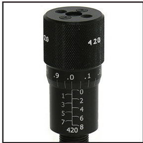
T420 Micrometer (Available) P/N:103085

The P400 Portable series hose crimper paired with either a ValPower® Hand Pump, Pneumatic Pump or Electric Pump make the perfect combination for portable crimping requirements.