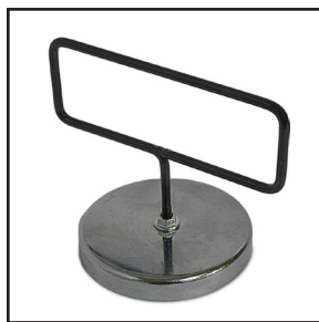
Die Removal Magnet (Included) P/N:104679