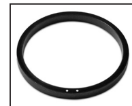
T400 Spacer Ring #2 P/N:PF402-2-SR