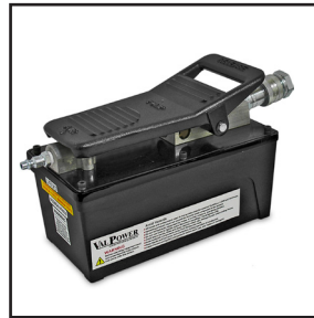
Pneumatic Pump (Available) P/N:VAP-10-100