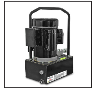
Electric Pump (Available) P/N:VEP1001