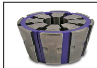
T400 12mm Die Set P/N:PF402-12D

Light Weight Portable Unit: Truly "portable" crimper can be carried to almost any location where service is required.