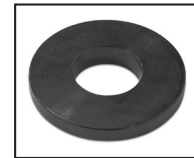
T400 Main Pusher Plate W/ Magnets P/N:PF400-MPP