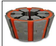
T400 17.4mm Die Set P/N:PF402-17.4D