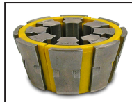
T400 14.2mm Die Set P/N:PF402-14.2D