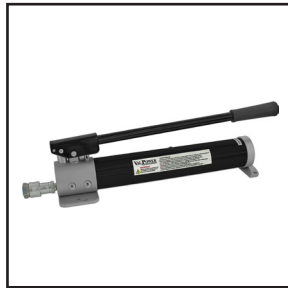
Hand Pump (Available) P/N:VHP-10-43