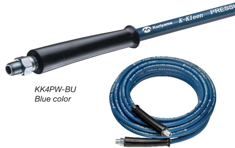
KK4PW-BU Blue color