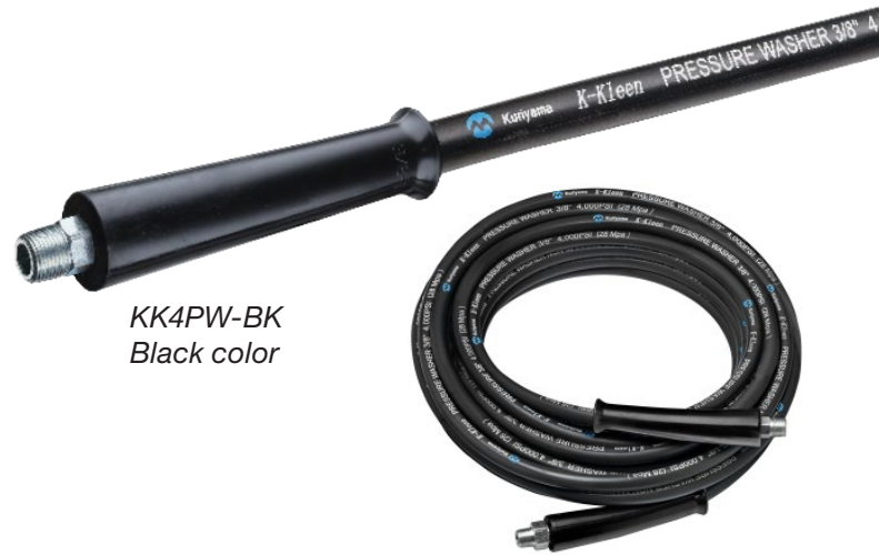
KK4PW-BK Black color