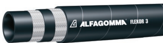
Two High Tensile Braids - R3-TR3 Meets or exceeds SAE 100R3 - EN 854 R3 - DN

One-wire braid-reinforced - TR5 Meets or exceeds SAE 100R5