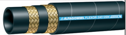
Double wire braid - Flexor 2SN/R2AT — Meets or exceeds SAE 100R2AT - EN 853 2SN MSHA IC-152/16 Approved