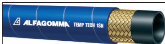
Single wire braid - Temp Tech 1SN Meets or exceeds SAE 100R1AT - EN 853 1SN Available in 1-wire construction (100R1AT, EN 853 1SN) in sizes 1/4" through 2" ID.