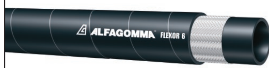
One High Tensile Braid - R6-TR6 Meets or exceeds SAE 100R6 - EN 864 R6 - DN