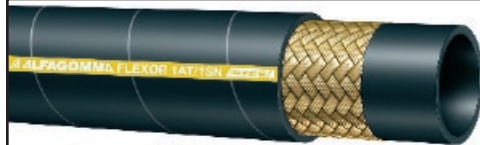
Single wire braid - 1SN/R1AT — Meets or exceeds SAE 100R1AT - EN 853 1SN MSHA-IC - 152(16) approved