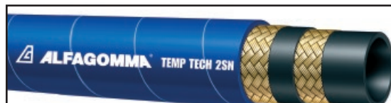
Double wire braid - Temp Tech 2SN Meets or exceeds SAE 100R2AT - EN 853 2SN Available in 2-wire construction (100R2AT, EN 853 2SN) in sizes 1/4" through 2" ID.

Because we continually examine ways to improve our products, we reserve the right to alter specifications or discontinue products without prior notice.